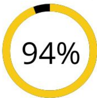
Recipient Emergency Stabilization Funds